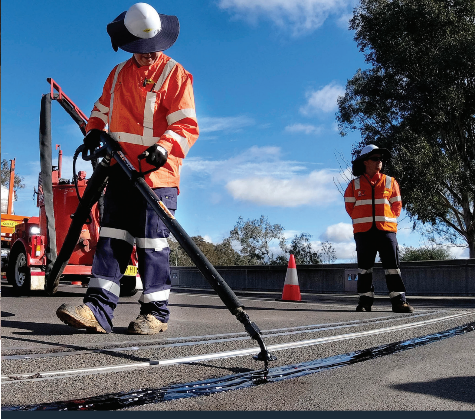
Crack sealing pavement maintenance at Parliament House