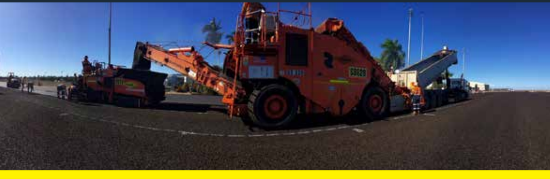
TOP: Paving Asphalt with I-Brid binder on the apron at Bundaberg Airport QLD in June 2020