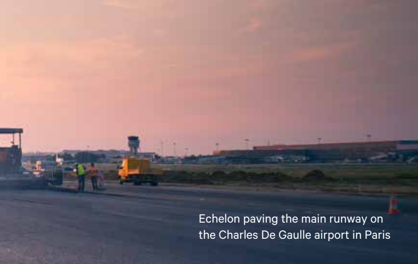
Echelon paving the main runway on the Charles De Gaulle airport in Paris